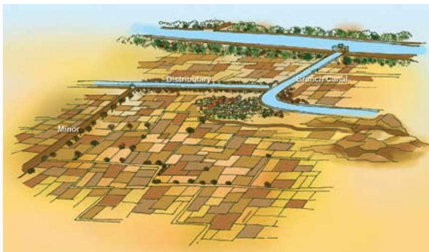
FIGURE 3. State of the command area soon after commissioning of the reservoir and the main system.