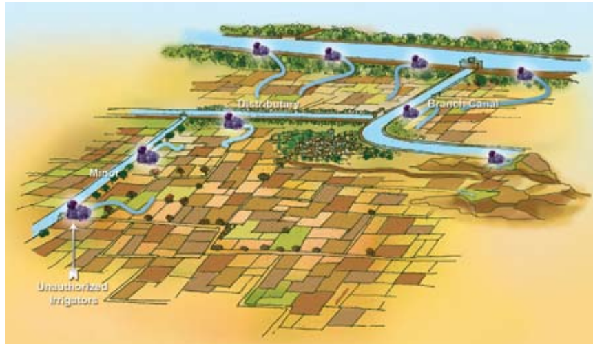
FIGURE 4. Chaotic development of the command area by illegal lifting of water along the main system.