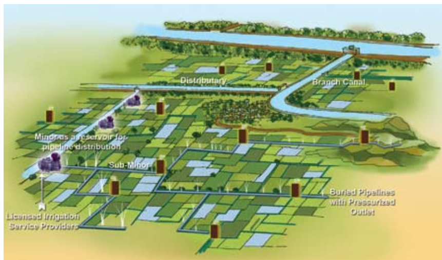
FIGURE 5. The IWMI proposal: Ban lifting of water from the main system, encourage investment in piped distribution from minor.