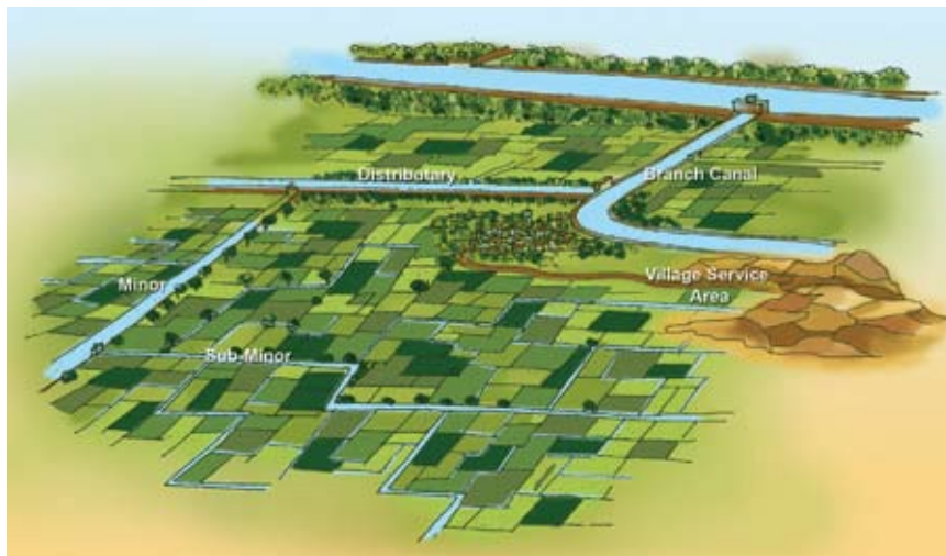
FIGURE 2. SSP Plan A: Water reaches the fields through sub-minor and open channels.

Figures 2, 3, 4 and 5 provide an artist's imagery of the logic of the IWMI proposal. Figure 2 shows the original vision of the SSP command area in the 1970s in which water was to flow into the VSA through a pucca sub-minor taking off from the minor and taking water to fields through a network of field channels. Figure 3 shows the situation in early 2000 when water began flowing in the main system but the command area remained dry for want of a distribution system below the minor. Figure 4 shows the spontaneous and unruly development of pump-and-pipe irrigation all over the main system by farmers lifting water at will. Figure 5 illustrates what IWMI proposes: ban lifting of water from the main system; ensure weekly rotation of water supply in minors, which may be treated as storages; and encourage farmers, cooperatives, and service providers to invest in a buried pipe distribution system to irrigate the VSA.