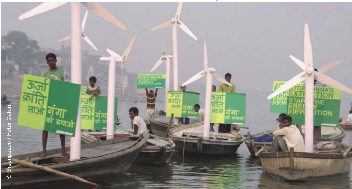
Image: Greenpeace floats replica wind turbines on the River Ganges in Varanasi, to highlight the impacts of climate change on the Ganges. They hold banners reading 'Stop Ganga's Extinction, Start the Energy [r]evolution'. Local people join the activity.

The country must implement definitive, well considered and effective action plans not only to eradicate the urban-rural divide and to move towards energy security, but also to emerge as a world leader in combating the climate change.