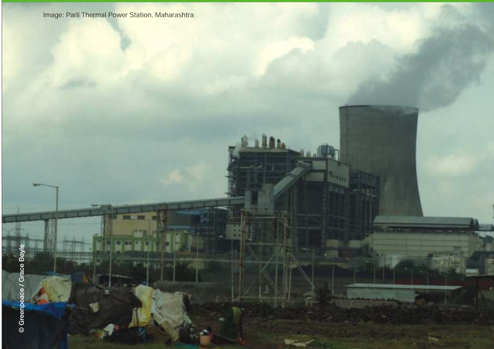
Image: Parli Thermal Power Station, Maharashtra

Night has fallen now, and the bright lights of the power station are shining orange in the distance. To our right, where Dadahari Wadgoan lies, there is nothing but darkness, as the village continues to have 10 to 15 hours of scheduled power cuts a day. For the moment, though, the residents are merely glad to be rid of the thick grey dust filling their homes. But for the communities who live near other dumping grounds - both of Parli and other thermal power stations - there is no such respite.