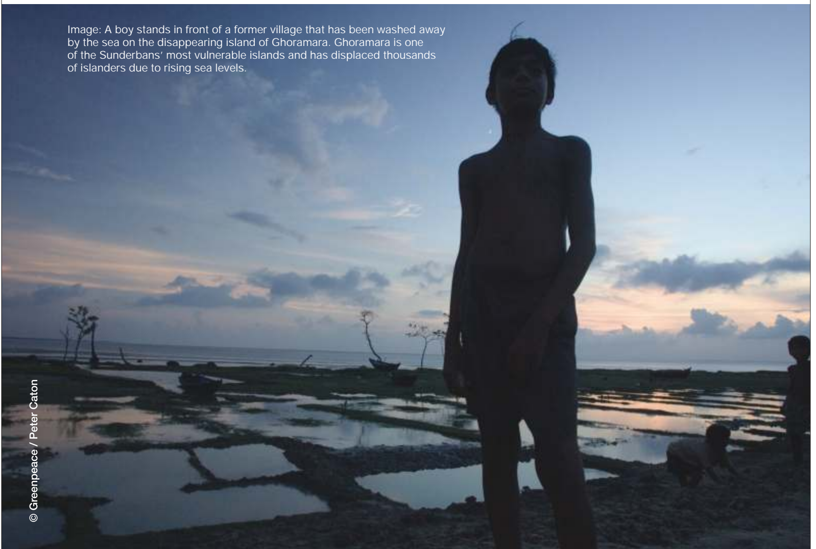
Image: A boy stands in front of a former village that has been washed away by the sea on the disappearing island of Ghoramara. Ghoramara is one of the Sunderbans' most vulnerable islands and has displaced thousands of islanders due to rising sea levels.