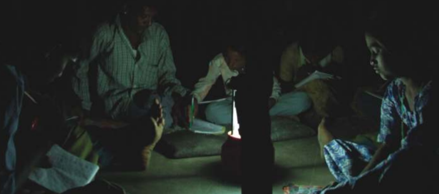
Image: Night school students studied in darkness until solar powered lamps were provided to the school

The majority of his days are spent lying on a mat in the house of his elderly mother as his condition means he cannot work, and has never married. He is in constant pain.