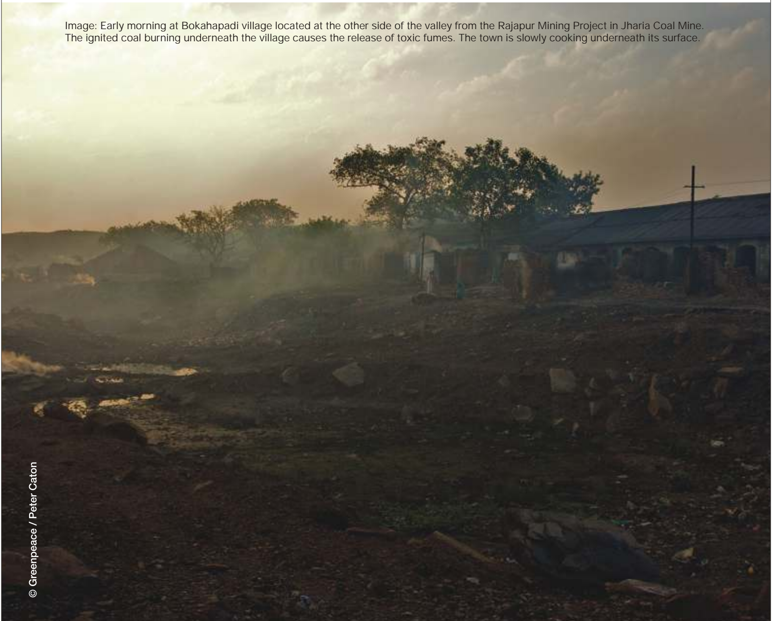
Image: Early morning at Bokahapadi village located at the other side of the valley from the Rajapur Mining Project in Jharia Coal Mine. The ignited coal burning underneath the village causes the release of toxic fumes. The town is slowly cooking underneath its surface.

conventional energy sources, are of centralised generation in nature and are connected to the grid. Though these conventional plants have been established at huge costs, they have not served the rural population well, sentencing them to bear the burden of the associated economic, social and environmental aspects as summarised in Table 8. Fossil fuel based and hydro-based power plants supported by grid-based centralised electricity supply systems thus cannot be seen as a sustainable option, and are not in the long-term interests of the Indian society.